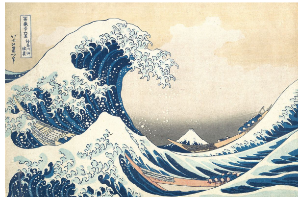
The Great Wave - Hokusai wood block print

Comments on images will be made by those attending in person. Due to technical issues, Zoom attendees will not be able to make comments during the meeting. The images will be available to all members by email to be sent out 2-3 days in advance. This will give you a chance to preview and critique images beforehand.