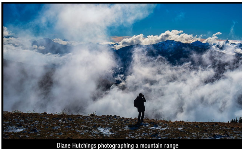
Diane Hutchings photographing a mountain range

The drive up was filled with photography talk (who has new equipment, what new lens, what kind of setting, etc). Glen, Diane and I are Nikon camera enthusiasts so we had plenty to talk about. The skies were clear at the Hurricane Ridge parking lot which meant blue skies all around (the landscape photographer's nemesis). This meant looking for the