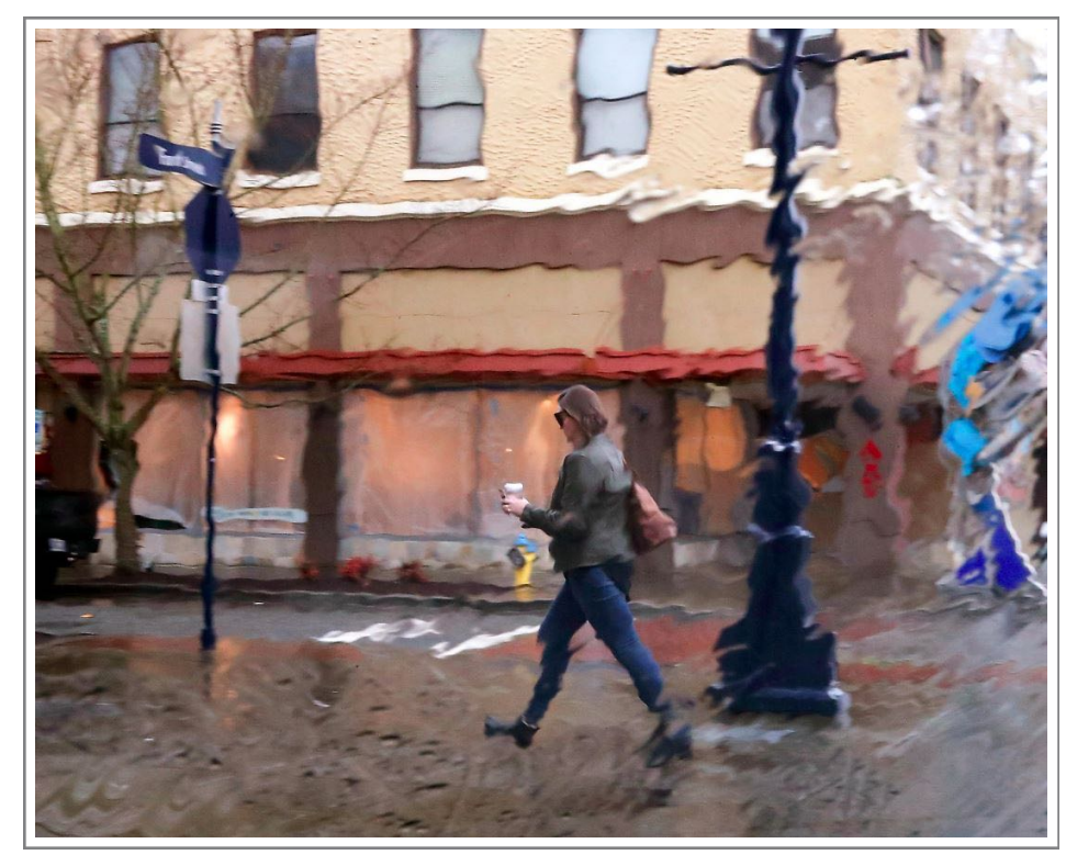
Please join us to learn about photojournalism and ask a question of this engaging and talented photographer.

A Zoom link to the meeting will be sent out a few days ahead of time.